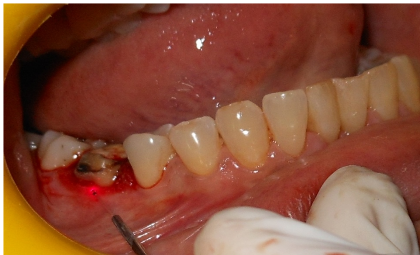
Figure 6. Photograph showing the crown lengthening with Laser in case 2