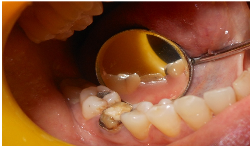
Figure 5. Preoperative photograph before crown lengthening in case 2

A diode laser (Ezlase, Biolase Technologies; CA, USA) with a wavelength of 940nm was used for the procedure. After sufficient anesthesia was achieved, the laser unit comprising of a 400- \mu m disposable tip was used in a contact mode with a setting of 0.8 to 1.5 watts in continuous mode along the demarcated area with a paint brush like strokes progressing slowly to remove the gingival tissue and expose adequate amount of tooth structure. During the entire procedure, the tip was constantly checked for any debris of the ablated tissues and was cleaned with sterile moist gauze. Physiological gingival contour was achieved by changing the angulation of the tip as required during the procedure (Figures 5-7).