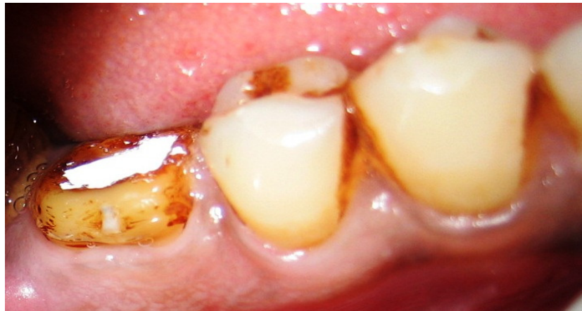
Figure 2. Preoperative photograph before crown lengthening in case 1

excised. Left out tissue tags and any beads of granulation tissue were removed to attain a smooth surface (Figures 2-4).