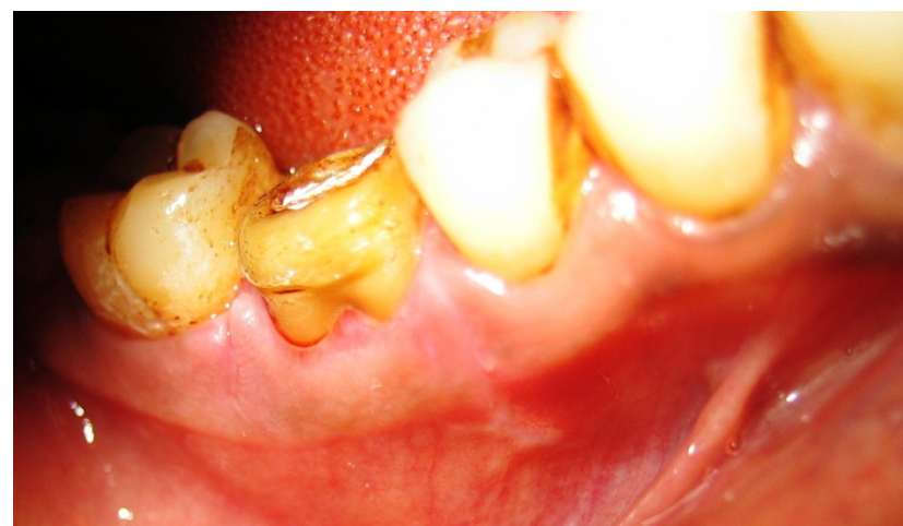
Figure 4. Post operative photograph after crown lengthening with scalpel in case 1