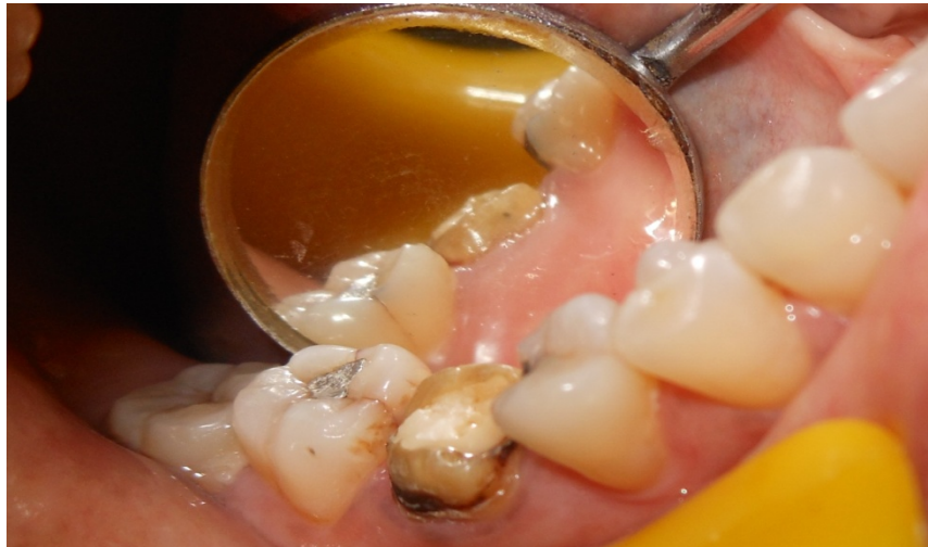
Figure 7. Post operative photograph after crown lengthening with Laser in case 2

Analgesics were prescribed for the patients and were advised to be taken if required. Out of 11 patients in scalpel group 8 patients reported the use of analgesics and 2 Patients reported use of analgesics in the laser group in the immediate 24 hour post operative period. Considering that the patients in both the groups having taken the analgesics only on the first postoperative day, this did not have an influence on the VAS scores as the patients were recalled on the 3 rd day. Necessary plaque control measures and oral hygiene instructions were instructed to all the patients.