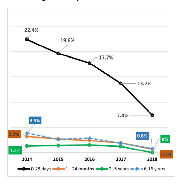
Fig. 2. Age-specific mortality trends