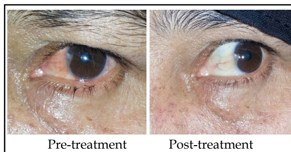
Fig.2: Showing clinical appearance of pterygium before and after treatment.

Although use of 5-FU in filtering glaucoma surgery revealed adverse effects on corneal epithelial cells leading to keratopathy, we found