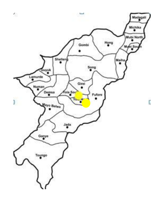
Fig. 1. The map of Adamawa state, Nigeria