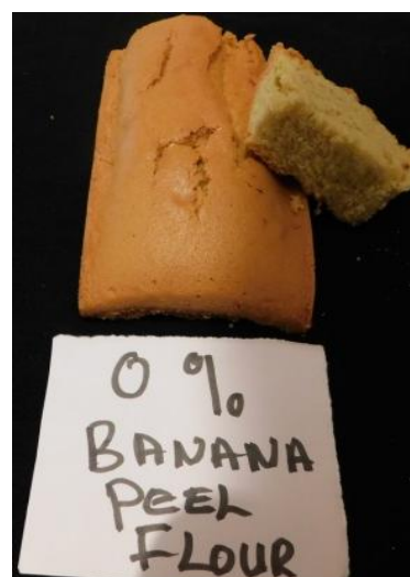
Fig. 1b. Cake prepared with 0% ripe banana flour (Control)