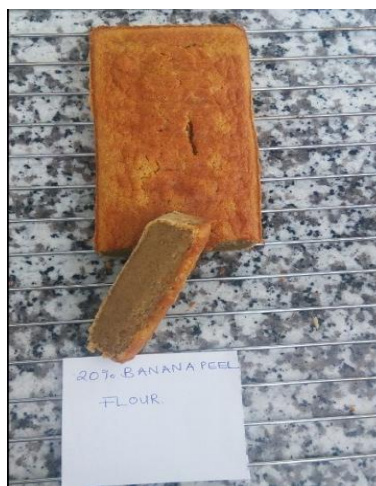
Fig. 1a. Cake prepared with 20% ripe banana flour

The lipids content found in banana peel powder was 1.5 \pm 0.01 , similar to that found by Morais R. et al. [18], but lower than found by Munguti JM. [19]. This might be due either the differences in varieties or to geographical factors. Banana peels are rich source of dietary fibre.