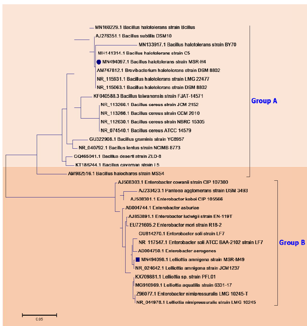
Fig. 1. Phylogenetic tree of isolated rhizosphere bacteria

with other treatments at all soil salinity levels. At 6 dSm -1 soil salinity the grains yield was 3.37 g plant -1 with duel inoculation compared with 1.8 g plant -1 un-inoculated one.