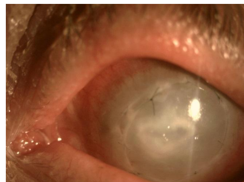
Fig. 1. Single layer AM sutured to cornea

Patients were followed up every 2 days for 2 weeks then twice weekly till complete healing.