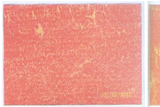
Fig. 2a. Sample test (C) of liver