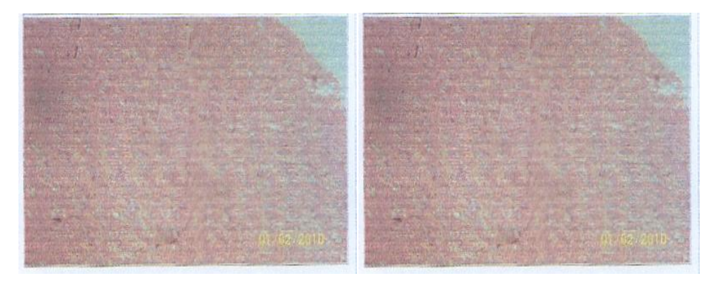
Fig. 1a. Sample test (C) of brain