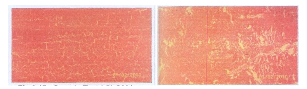
Fig. 7a. Sample test (B) of liver

Yusuf-Babatunde et al.; JAMPS, 22(3): 41-48, 2020; Article no.JAMPS.56420