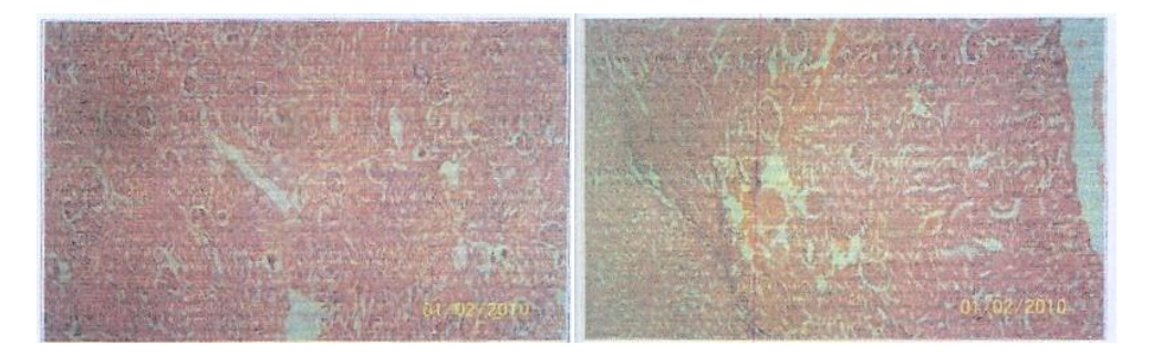
Fig. 8a. Sample test (B) of kidney