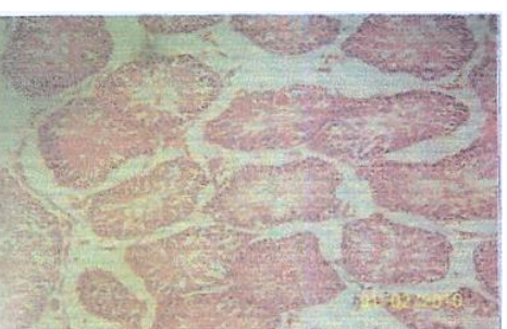
Fig. 5b. Control test (D) of testes