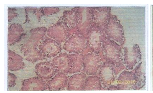
Fig. 5a. Sample test (C) of testes