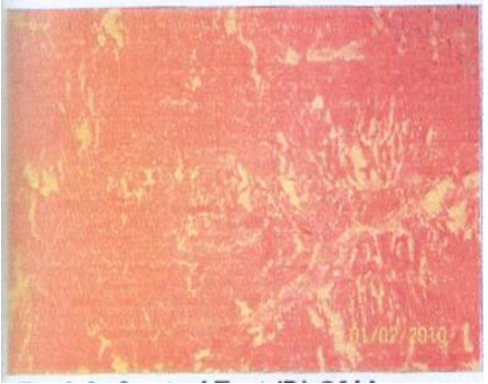
Fig. 2b. Control test (D) of liver