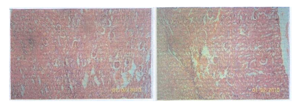
Fig. 3a. Sample test (C) of kidney

Yusuf-Babatunde et al.; JAMPS, 22(3): 41-48, 2020; Article no.JAMPS.56420