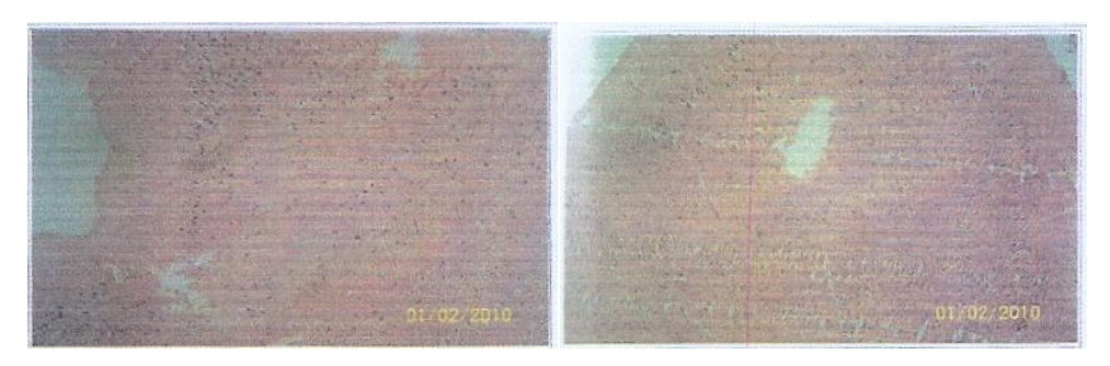
Fig. 6a. Sample test (B) of brain