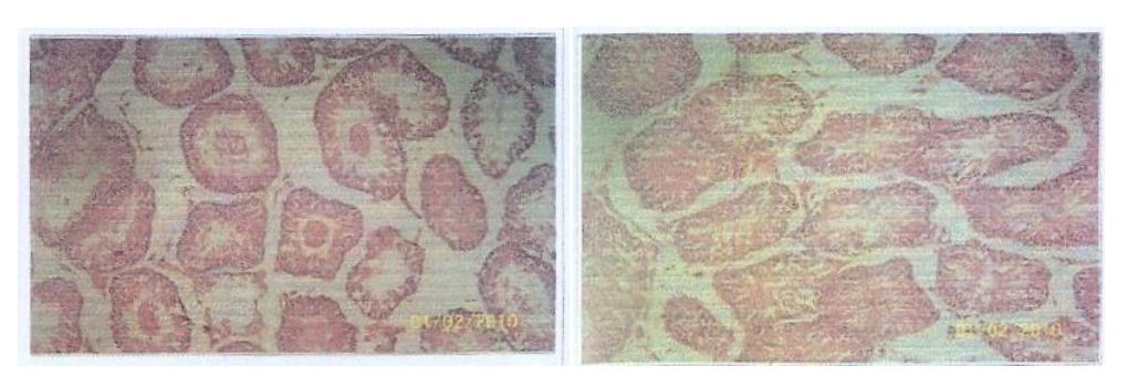
Fig. 10a. Sample test (B) of testes