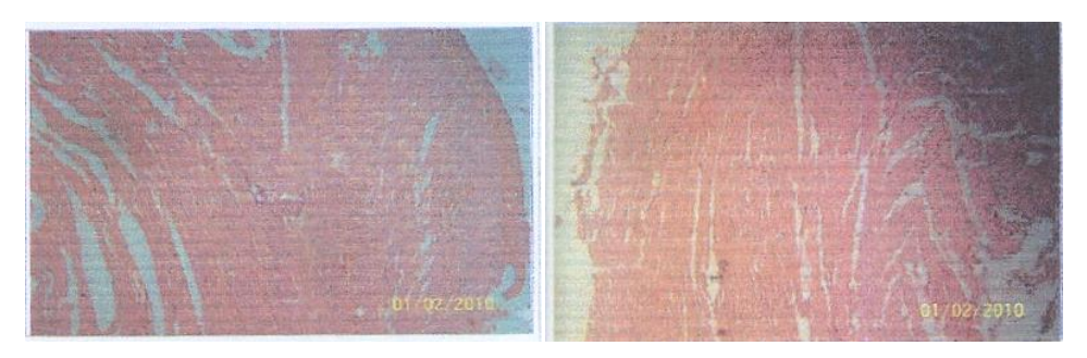
Fig. 4a. Sample test (C) of heart