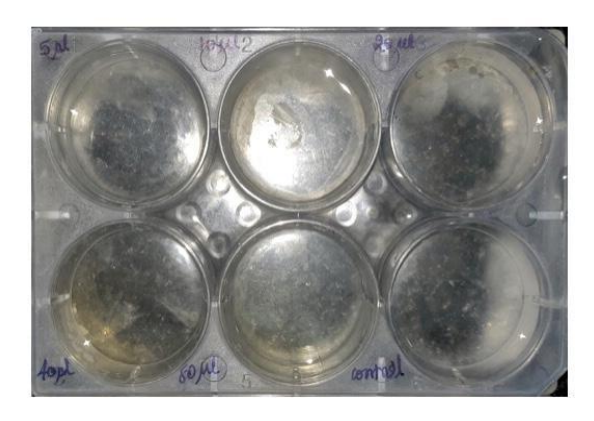
Fig. 2. Shows the Brine shrimp lethality assay