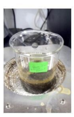
Fig. 1. Shows the preparation of herbal formulation