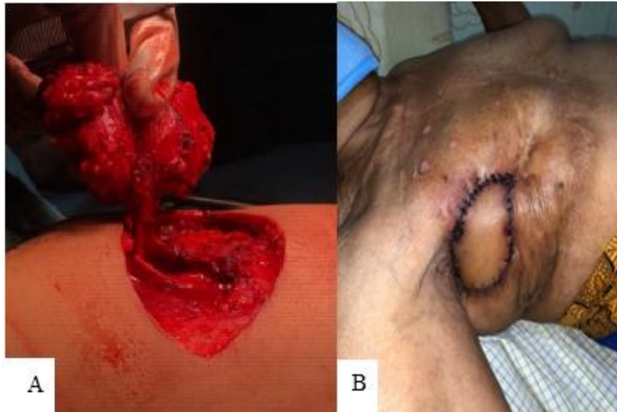
Fig. 4. The result of the second case

A: Durante op, B: Post-operative result C: A month post-operative follow-up