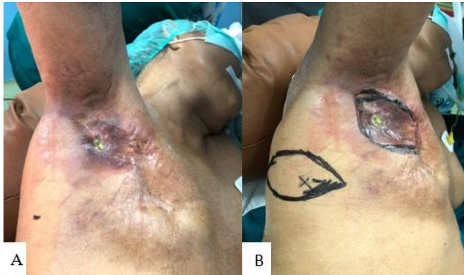
Fig. 2. Preoperative condition of the second case A: ulcer condition, B: donor site mark