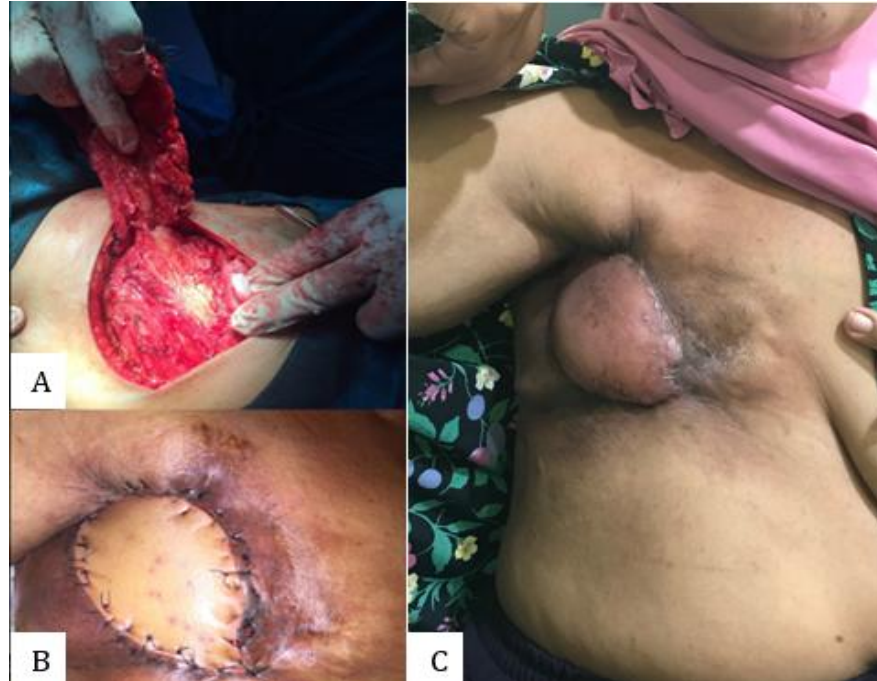
Fig. 3. The result of the first case

A: Durante op, B: Post-operative result C: A month post-operative follow-up