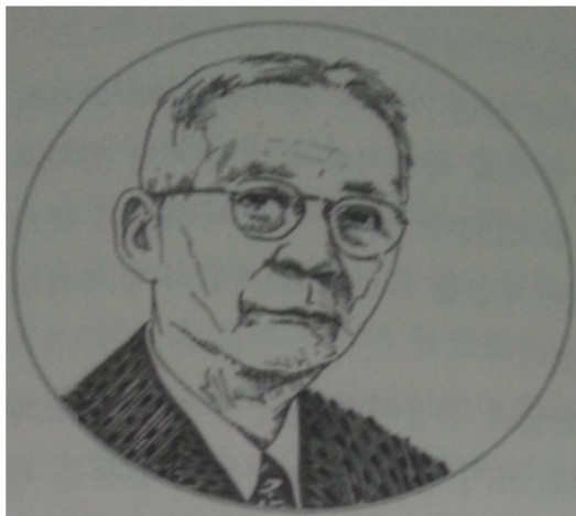
Figure 1. Seo Jaepil (1864 ~ 1951 21 )

Later, Seo Jaepil (1864–1951), who was once involved in the Gapsin Coup from Openness Party, established the "Independent News" on April 7, 1896. This was the first private newspaper in the history of the Korean Peninsula. Not only that, the newspaper was written in pure Korean every other day, and the front page published doctrines and advertisements. The second edition and the third edition of the newspaper publish official newspapers, foreign newsletters, and social news. The fourth edition is edited in English. This newspaper is more focused on comments than news reports and has a unique enlightenment significance 20 .