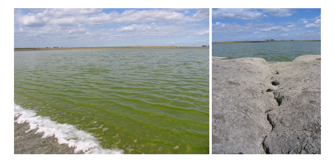
Fig. 1. The particular color observed at Movila Miresei Hypersaline Lake. The physical aspect of the lake was recorded in photo images using a digital camera Canon PowerShot model Pro 1