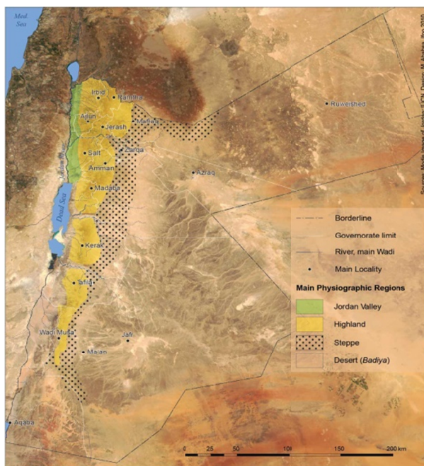
Figure 3. Study area (in green)