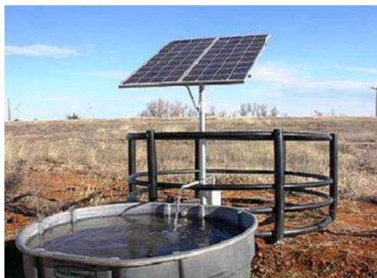
Figure 2. Simple PV system

availability of electricity. Transforming solar energy into electricity through photovoltaic (PV) technology is the dominant application to develop renewable energy sources. This method is based on a technique using solar panels containing electrochemical cells that convert sunlight into electrical energy. Due to the continuous decrease in its cost, the presence of several competing companies in the market and the existence of researches related to its efficiency this technology began to spread widely in many countries (Curtis, 2010). Due to High Grade energy output the PV cells are used to run the electrical equipments directly. One of the remarkable applications of solar PV is to provide electricity to Agricultural water pumps. Many research studies were carried out to investigate the performance of water pumps based on solar energy (Campana et al., 2013, 2015; Korpalea et al., 2016). A photovoltaic water pumping system (PVWPs) is a combination of different components connected together to fulfill the water requirement. Figure 2 shows illustration of simple PV system. The power from sun converted by PV module is transferred to the pump which in turn delivers water to where it is needed. The main components of the system are PV array, controller or inverter (s) and motor-pump unit.