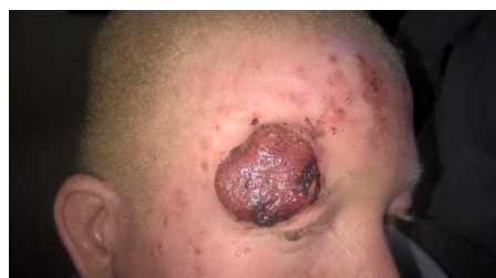
Fig. 3. BCC in an albino