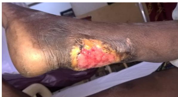
Fig. 4. Marjolin ulcer in postburn scar