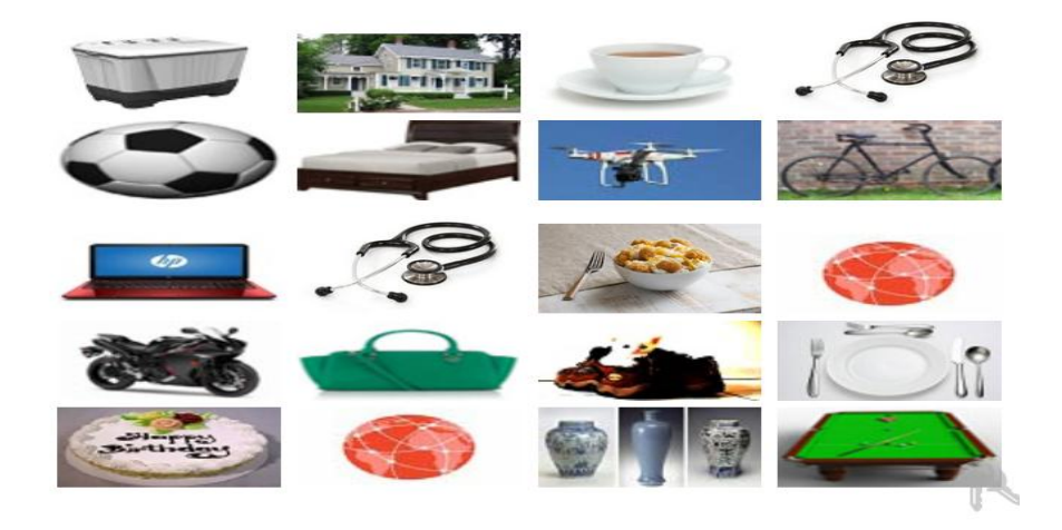
Fig. 2. Screenshot of pass pictures selection page for Registration