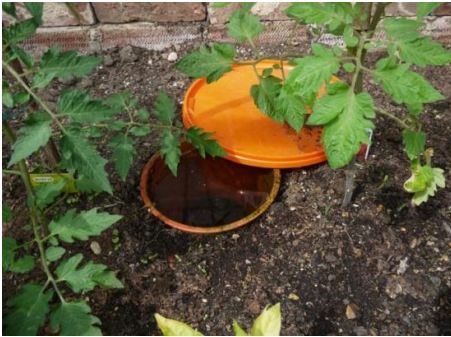
Fig. 2. Buried clay pot with crops

water-saving technologies like drip and sprinkler systems to irrigate their crops so that their scarcely available water resources will not be deleted. Here again, although such irrigation methods are known to save about half of the water presently used for surface or furrow irrigation, their technical, economical (high investment and operational costs), and socio-cultural factors have remained a serious hindrance from adoption, especially by small-scale farmers [7]. The use of such techniques has thus been limited to commercial farms and to those areas with relatively plain landscapes or topographies that are relatively located in closer proximity to water points. As such, the large majority of smallholder farmers in those areas are still by and large deprived of irrigated farming and so much exposed to food and nutrition insecurity.