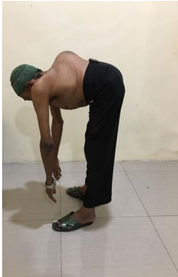
Fig. 2b. A bump in hyperkyphosis patients, is visible when bending over