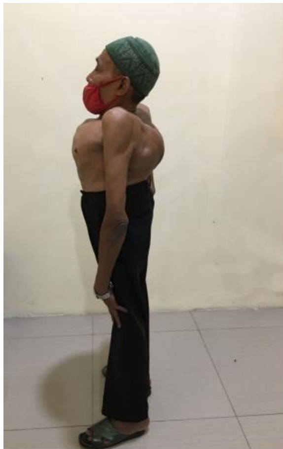
Fig. 2a. Hyperkyphosis from lateral view