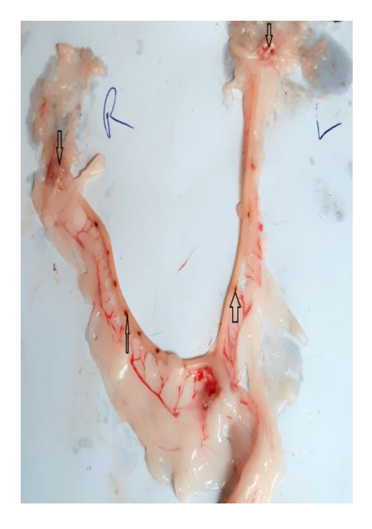
Fig. 3. 500mg/kg ang 1000mg/kg ↑ (Aborted embryo), ↓; Ovary

The result of the haematology revealed that hemoglobin concentration of the blood was lower in all the treatment groups but erythrocyte indices were not significantly different from control. Also