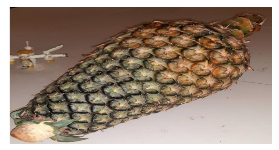
Fig. 1. Queens pineapple JPG

Fifty two albino rats were used for in vivo experimentation; 40 were females of 12 weeks of age and 13 males of 14 weeks of age. Each male was kept in a separate cage. The rats were procured from the Departmental animal house of the Department of Veterinary Physiology and Pharmacology, Michael Okpara University of Agriculture, Umudike. The rats were kept in standard cages and fed Topfeed chick marsh ad libitum and had access to clean water. They were acclimatized for one week and the estrus of the females induced using peanut extract (Luchis Estrus Milk) at a dose of 800mg/kg body weight [13]. Then three females picked at random were introduced per male for impregnation. The male in cage 6 which has very high libido (Grooms, Sniffs and attempt to mount in split seconds) were given 4 females to impregnate. Breeding was confirmed through vaginal cytology. Twelve female rats were used to study each trimester effect. In all the trimesters, the twelve rats were divided into 3 groups of 4 rats per group while the remaining 4 impregnated rats served as control for the three trimester treatment groups. In each trimester, the first group was given 250mg/kg body weight of pineapple juice, the second group was given 500mg/kg and the third group was given 1000mg/kg of pineapple juice while the control group was given 2ml/kg body weight of distilled water.