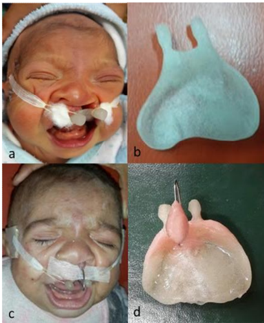
Fig. 2. PNAM appliance in the children's oral cavity: a. extraoral view, b. PNAM appliance, c. extraoral view after addition of nasal stents and d. PNAM appliance with nasal stents

The alveolar intersegment defect through PNAM was reduced from 6 mm to 0 mm, nasal height was increased from 0 mm to 5 mm and columella was increased from 3 mm to 5 mm (Fig. 3). Average palatal width was 36 mm in pretreatment and 37 mm in post NAM. The measurements were taken by only one trained orthodontist to avoid ambiguity in data collection.