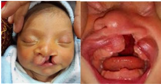
Fig. 1. Left sided complete clefts of the lip, alveolus and palate

After fitting of the tray the patient was recalled on the next day to check for a regular check up to investigate any kind of ulceration due to the appliance and to check proper placement of the appliance by the parents. The patient was recalled for regular weekly checkups for appliance modification. Nasal stents made of self cured acrylic (BMS, Italy) were added on the third appointment when the alveolar cleft was reduced up to 4mm, at that time patient was 1 month old. The nasal stents were covered with a thin veneer of soft acrylic to give soft elastic pressure (Figs. 2c, d). The nasal stent was adjusted every week to get desired shape of the nostril and the alar base.