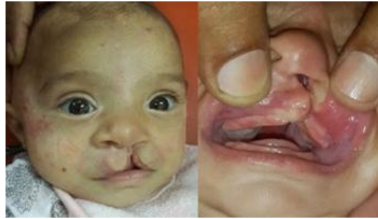
Fig. 3. After PNAM treatment, size of the alveolar cleft reduced, nasal height and columella height increased

The alveolar intersegment defect through PNAM was reduced from 6 mm to 0 mm, nasal height was increased from 0 mm to 5 mm and columella was increased from 3 mm to 5 mm (Fig. 3). Average palatal width was 36 mm in pretreatment and 37 mm in post NAM. The measurements were taken by only one trained orthodontist to avoid ambiguity in data collection.