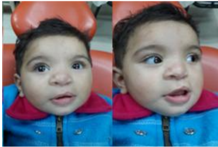
Fig. 5. Extraoral views after 1 year follow-up