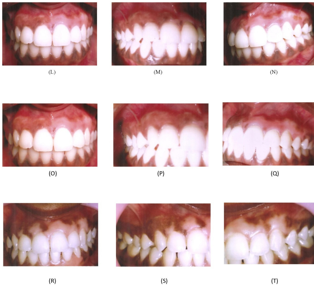
A) Preoperative picture of frontal view with grade 3 Oral pigmentation index (Dummett C.O Gupta), B) Preoperative picture of right lateral view, C) Preoperative picture of left lateral view, D) During treatment with laser therapy, E) During treatment with cryosurgery, F) Immediate post operative picture of frontal view after 2 weeks, G) Immediate post operative picture of right lateral view, H) Immediate post operative picture of lateral lateral view, I) One month post operative picture of frontal view, J) One month post operative picture of right lateral view, K) One month post operative picture of left lateral view, L) Three months post operative picture of frontal view, M) Three months post operative picture of left lateral view, N) Three months post operative picture of right lateral view, O) Six months post operative picture of frontal view, P) Six months post operative picture of right lateral view, Q) Six months post operative picture of left lateral view, R) Nine months post operative picture of frontal view, S) Nine months post operative picture of right lateral view, T) Nine months post operative picture of left lateral view