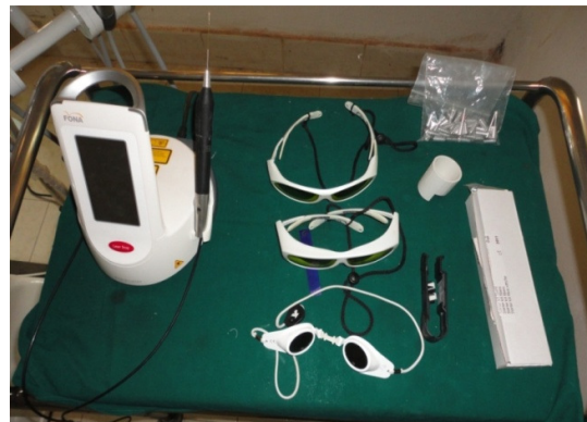
Fig. 1. Laser unit

The laser equipment used in this study is a semiconductor diode laser (Ga, Al, As) manufactured by FONA™ (Fig. 1), with a wavelength of 970\pm 15\text{nm} , and operatory modes were of Continuous wave, Chopped mode and peak pulse mode. The power range was of 0.5-4W and peak pulse 7W with a frequency of 1Hz-100Hz with dimensions of 19.7\times 18.2\times 18.9\text{ cm} .