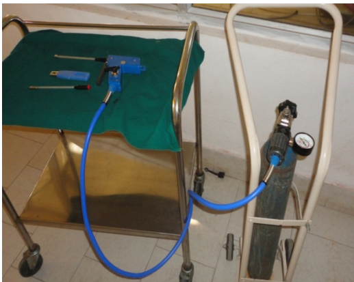
Fig. 2. Cryosurgical unit

The cryosurgical apparatus used was cryo super deluxe model no 004-B manufactured by (Basco Cryos company) (Figs. 2 and 3), this works on the Joule-Thomson principle using nitrous oxide gas at a temperature of -70 to -80°C at the probe tip. After the laser application was completed cryosurgery was performed in the same sitting. Cryosurgery was performed with the probe tip placed on the surgical area with a derm probe pointing towards the interdental area. After the freezing began, the probe tip adheres to the tissues forming visible snow white ice ball. After 10 seconds the piston trigger was released and the probe along with the tissues were allowed to thaw sufficiently before removal. The entire surgical area were frozen in concentric circles following which a repeated cycle of application was done for another 10 seconds to ensure gingiva completely free of pigmentation.