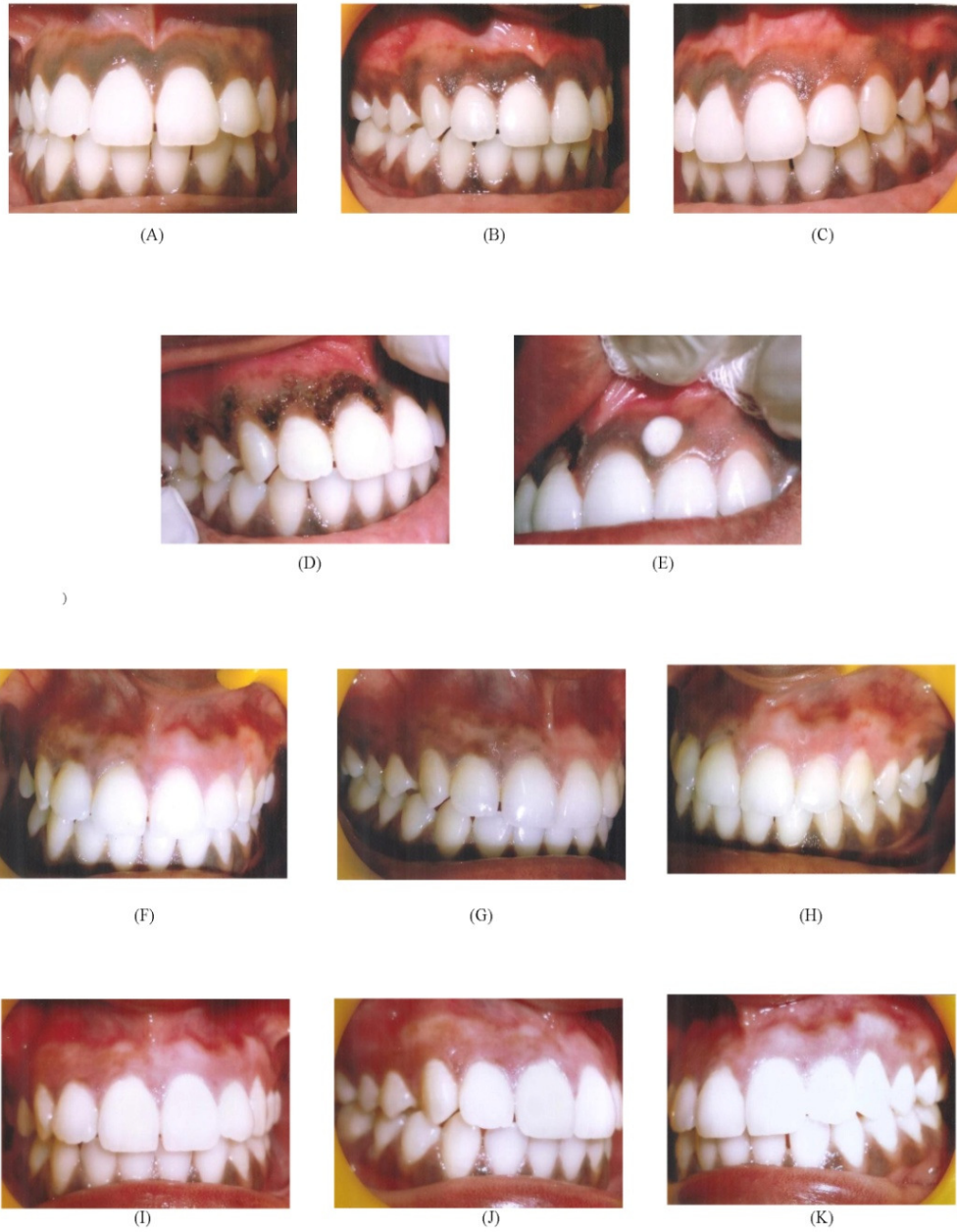
Fig. 4. Clinical figures of one patient undergone laser and cryosurgical depigmentation procedure for the period of 9 months