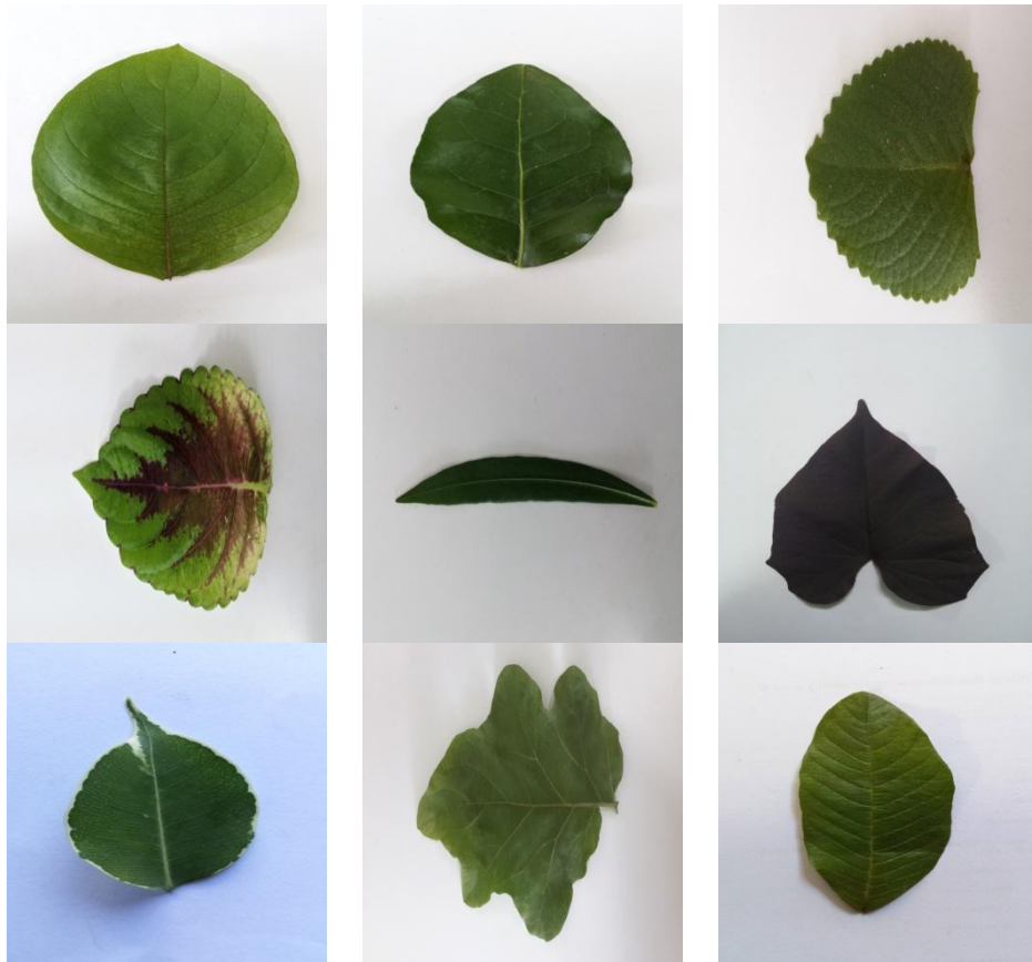
Fig. 3 Folio database plant leaf images

The performance of PLR system is measured in terms of accuracy. The system classifies the plant leaf by ensemble approach with four different kernels in SVM. Thus, the dataset is divided randomly into two sets with 60% images for training and 40% for testing. This process is repeated 4 times so that each classifier is trained with different training samples and tested with different testing samples. Finally, the ensemble approach uses their individual performance to make final decision. Table 1 shows the performance of PLR system in terms of accuracy.